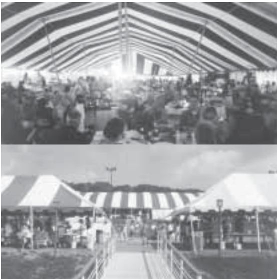
Golden Artist Colors - Columbus, NY